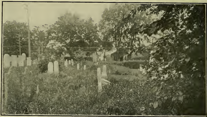
View of the Newer Portion, Looking North.